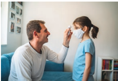
Daily Health Questionnaire