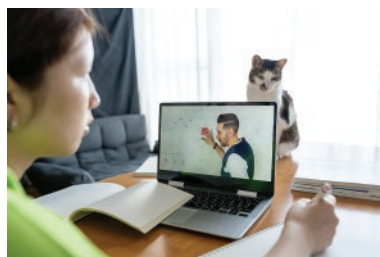
Remote Classroom Instructional Form