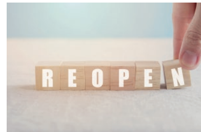
NYS School Reopening Master Guidance Plan Form