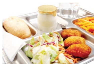
Advanced Lunch Needs Planning Form